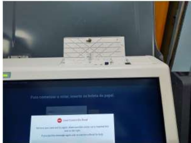
(Rubin Decl. at ¶ 10.)