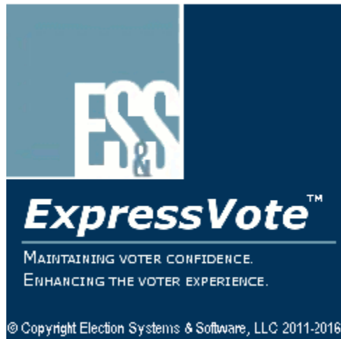
Photograph 1: EVS 5.2.2.0 sysload.bmp

Pro V&V then retrieved the sysload.bmp from EVS 5.2.2.0, as presented in Photograph 1.