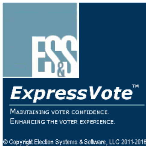
Photograph 2: EVS 6.0.2.0 sysload.bmp

The sysload.bmp file from EVS 6.0.2.0 was retrieved, as depicted in Photograph 2.